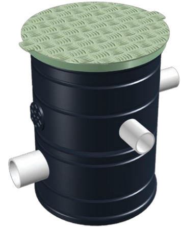
Large Filtration Unit