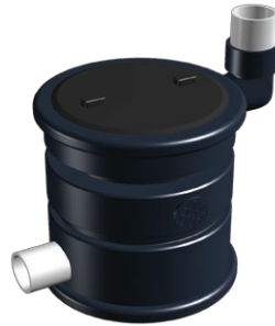
Small Filtration Unit