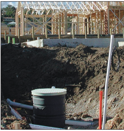
Installation of an Atlantis® Filtration Unit in the garden area of new home.