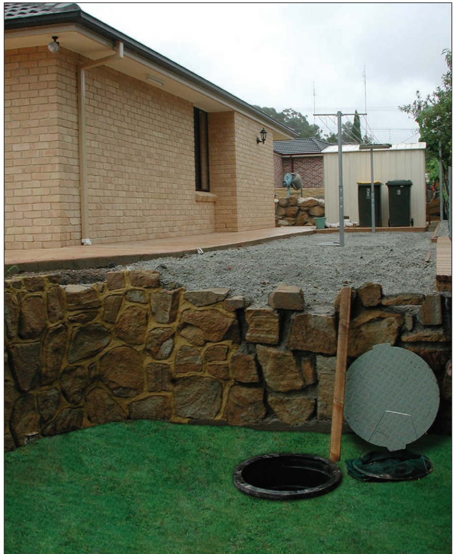
An Atlantis ® Filtration Unit installed into the garden area.