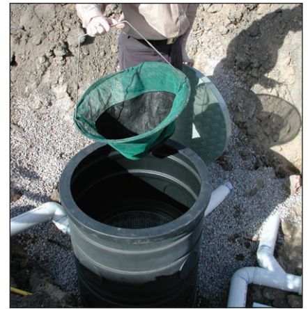
The trash screen collects all gross pollutants and micro pollutants as small as 180 microns.