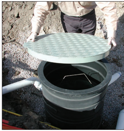
The large Atlantis® Filtration Unit features a lightweight aluminium lid allowing easy access for maintenance.